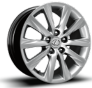
17-in 10-spoke alloy wheels 24 IS250/350