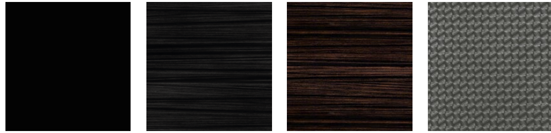
ILLUSTRIOUS PIANO BLACK† LINEAR DARK GRAY WOOD LINEAR DARK BROWN WOOD SILVER PERFORMANCE*