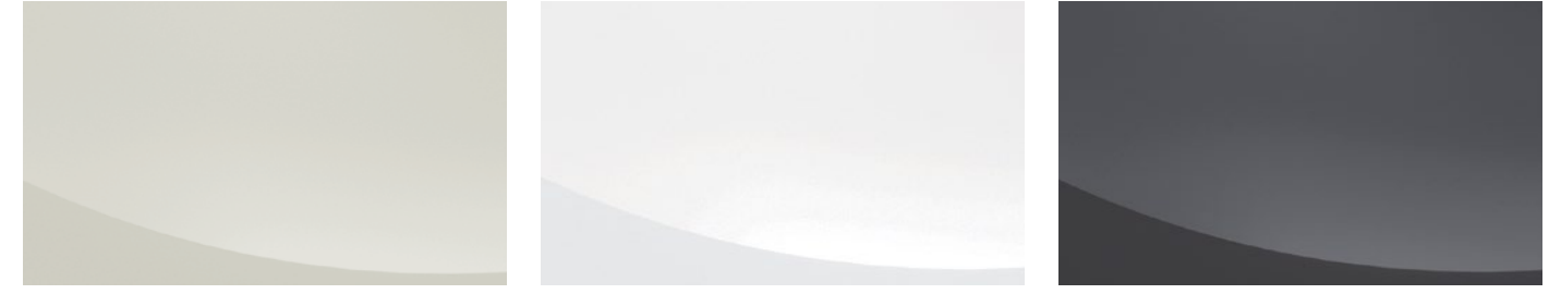
STARFIRE PEARL ULTRA WHITE* NEBULA GRAY PEARL