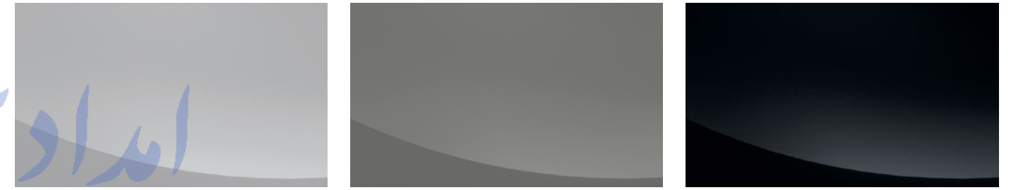
SILVER LINING METALLIC ATOMIC SILVER OBSIDIAN