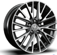
18-in mesh alloy wheels 24 Available IS250