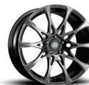
19-in full-face forged alloy wheels 24 Available IS250/350 RWD