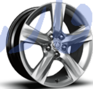
18-in five-spoke alloy wheels 24 Available IS350