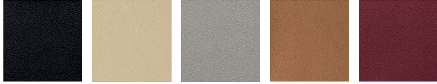
BLACK LEATHER or NULUXE PARCHMENT LEATHER or NULUXE STRATUS GRAY LEATHER or NULUXE FLAXEN LEATHER or NULUXE RIOJA RED** NULUXE