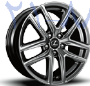
18-in split-five-spoke alloy wheels 24 IS FSPORT