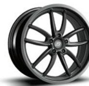
19-in forged alloy wheels 24 Available IS250/350 RWD