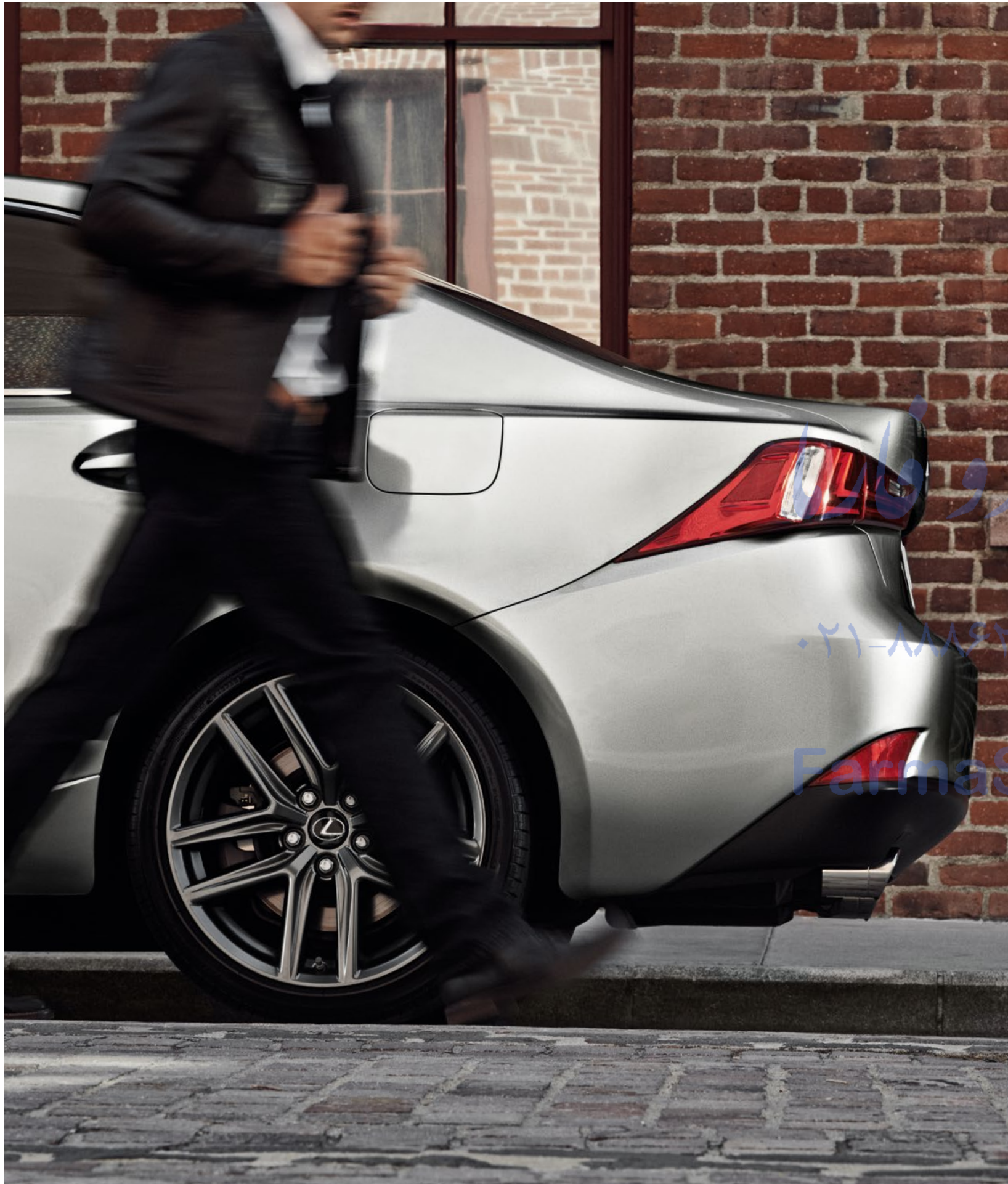
2 IS F SPORT shown in Atomic Silver // Options shown.