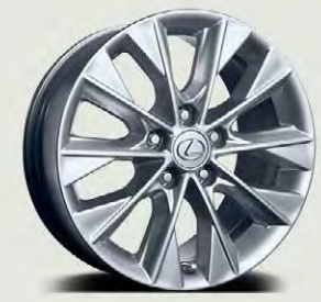
17-in split-five-spoke alloy wheels 10 STANDARD ESh