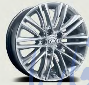
17-in split-10-spoke alloy wheels 10 with High Gloss finish OPTIONAL ES