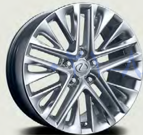
18-in split-10-spoke alloy wheels 12 with High Gloss finish OPTIONAL ES