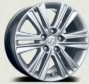
17-in split-six-spoke alloy wheels 10 STANDARD ES